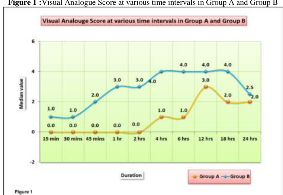
Figure 1: Visual Analogue Score at various time intervals in Group A and Group B